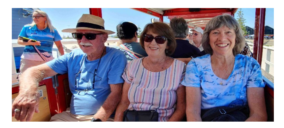
All aboard the jetty train