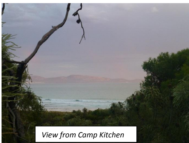
View from Camp Kitchen

Sunday was Brian and Helen's 47 th wedding anniversary and we started the day off with a pancake breakfast. With some trepidation from Helen and Maureen, we prepared for a drive to Dolphin Cove. Being unsure of the condition of the track, the boys let their tyres down and we set off on our 4 wheel drive adventure. As it turned out it was only about 6 km and the track would have been easily negotiated in a standard 2 wheel drive vehicle. The boys were somewhat disappointed and the girls were very relieved! There are signs everywhere saying if you get bogged the minimum cost of rescuing you is $1,000. Dolphin Bay is very pretty and we tried a bit of fishing and a very quick dip in the chilly southern waters. Maureen made a cake for afternoon tea in celebration of the wedding anniversary, and happy hour was followed by a roast lamb and roast vegetable dinner and a game of Mexican Trains. It had been a very hot day, about 40 deg., with a bit of a storm in the late afternoon, but the evening was perfect. We were all blown away by the absolutely fantastic coastal scenery at Cape Arid, and in fact all along the southern coastline, It is a long way from Perth but certainly worth the visit, but maybe with a bit more time to really explore the area