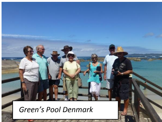
Green's Pool Denmark

played games in the camp kitchen but were a bit caught out when the lights automatically turned off at 10 pm and we had to pack up in the dark. On the Friday morning we all made our way to Green's Pool and Elephant Rocks – what a wonderful location: calm turquoise water, fine golden sand and huge granite boulders scattered throughout the swimming area providing a natural playground. On the walk around to Elephant Rocks you come across huge boulders that look just like a herd of elephants, then down to the water and another beautiful little bay. Everyone really enjoyed this marvellous experience. Whilst it was a nice sunny day, the water was a little chilly and Roy was the only one to take the plunge! At happy hour we had two games of Left Right and Centre with Brian B and Helen being the lucky winners of the $14 pot. Doug and Betty left us on Friday morning and the rest of us enjoyed the local attractions. The camp kitchen was quite large and we occupied two tables each night for dinner and games, finishing up on the Saturday night with a big feed of fish and chips from the local shop. Brian and Ronnie left us at Denmark to return home.