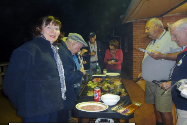
At the BBQ Friday night