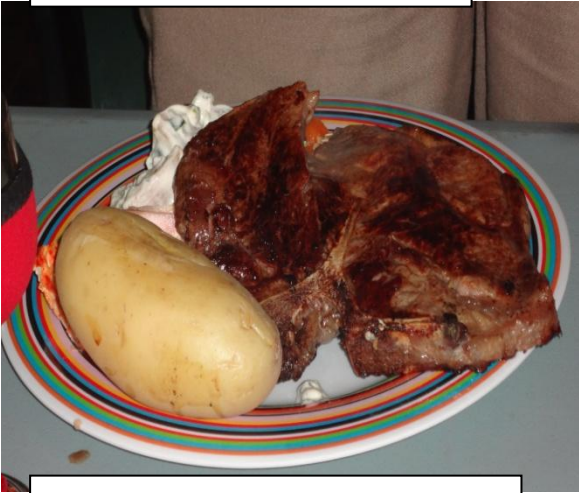
Is the steak big enough Helen?