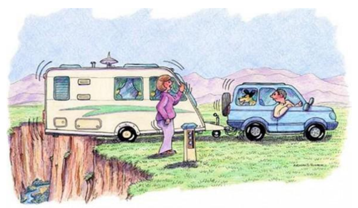
"Keep going, you're well clear of the bollard."

For more information go to <u>www.wheatbeltway.com.au</u>